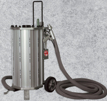
IBIX-Pro40 US ASME Certified: 41779